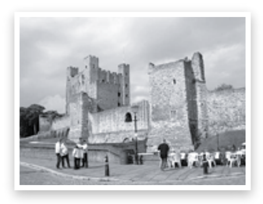
Rochester Castle. The castle was one of the first to be built of stone and at 125 feet is the tallest keep in England. It was constructed by the Bishop of Rochester in around 1090