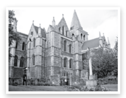
Rochester Cathedral. 1400 years of Christian worship, pilgrimage and prayer

The Sweeps Festival is a colourful mix of music, dancing and entertainment. An opportunity to see some of the traditional dances and hear the songs which have been past down from generation to generation.