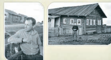
The museum of local history has different exhibitions: Brodsky in photos, history of railway.

To realize this project it is necessary to involve investors. They will invest money to make our settlement a better place... For realization of this plan it is very important to have a wish, to be active and clever.