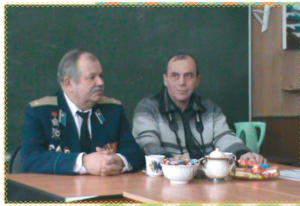
The quests of Honour